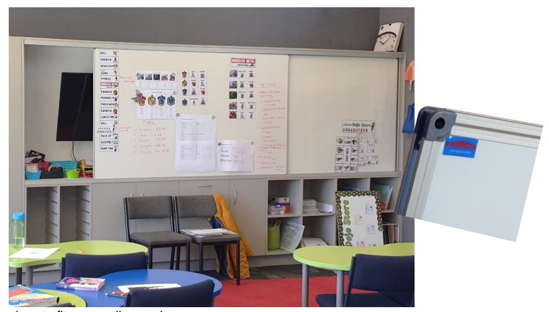
sizes to fit your wall space!