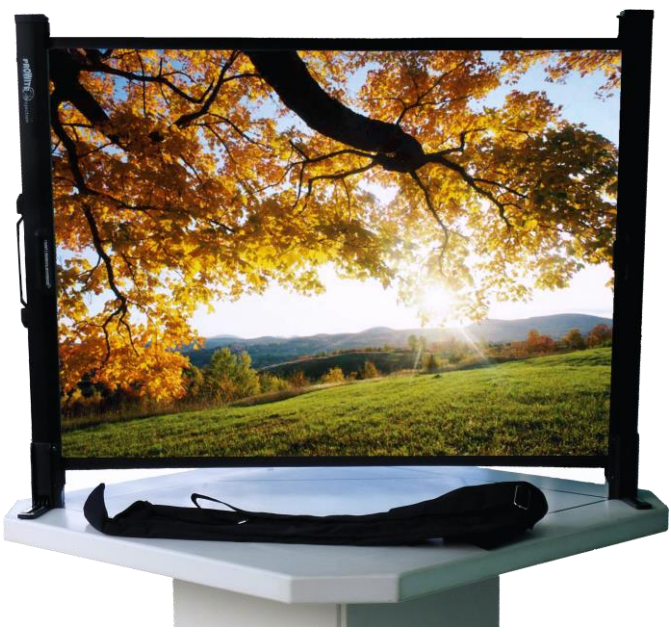
Table Projection Screen

Surface/Produced The PROWITE™ Projection Table Screen is extremely versatile. Being so easy to set up makes it perfect for presenting on-the-go or any situation. The screen has a black border when extended to full size, for enhanced viewing experience. Table screens are 4:3 format but the height can be adjusted making it adaptable to many scenarios. They have a fold out structure and feet making them firm and stable. The convenient handle on the back ensures that not only is it quick and easy to set up but can also be carried around with ease when stored away. A carry bag is included as well.